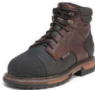
6" Men's IronClad