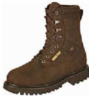
8" Men's Ranger