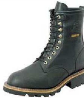
Men's Great Oak Loggers