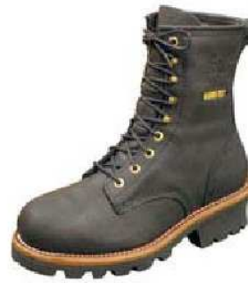
Men's Great Oak Loggers