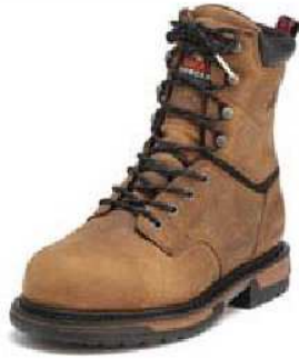
8" Men's IronClad