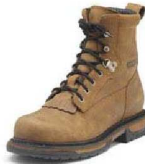
6" Men's IronClad Biker