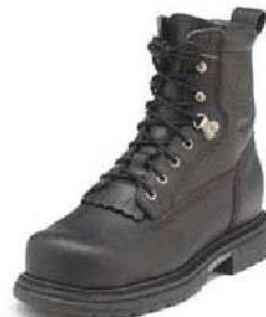
6" Men's IronClad Biker