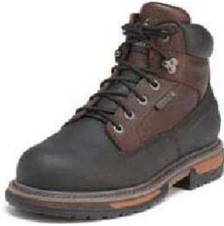
6" Men's IronClad