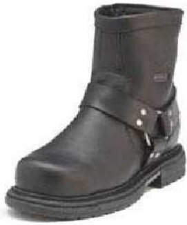
6" Men's IronClad Biker with side Zip