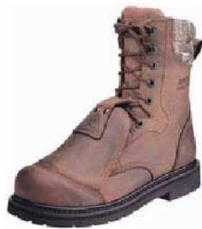
8" Men's MetGuard