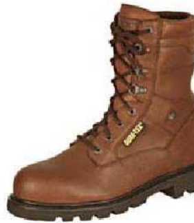
8" Men's Ranger