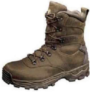
7" Sport Utility Pro