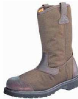
10" Work Wellington