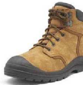
6" Men's Winter Tumbled