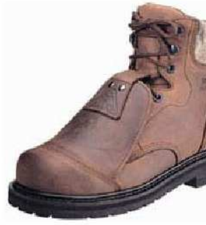
6" Men's MetGuard