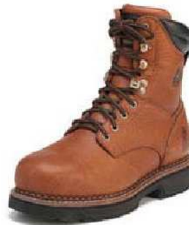
8" Men's WorkMax