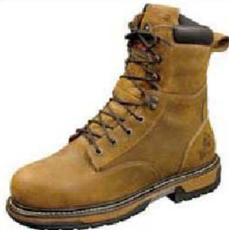
8" Men's Trail Crazy