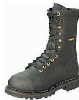
10" MetGuard Minor