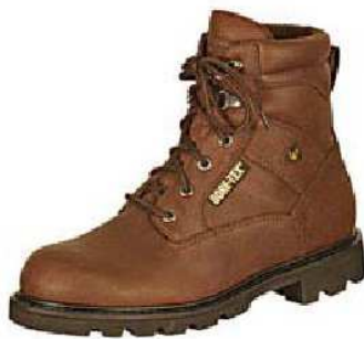
6" Men's Ranger