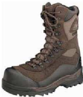
9" Blizzard Stalker