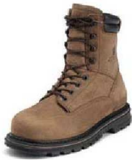
8" Men's Rocky/Vibram