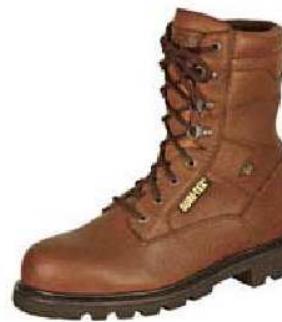
8" men's Ranger