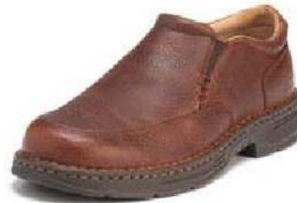
Twin Gore Slip on