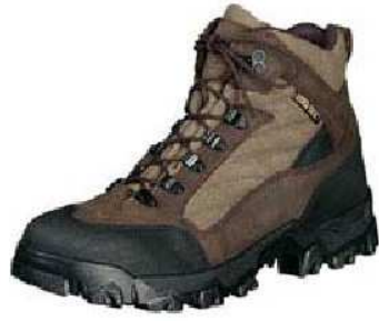
6" World Worker