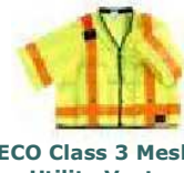
SECO Class 3 Mesh Utility Vest