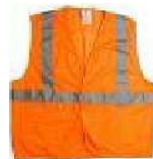
ANSI Class II Mesh Vests