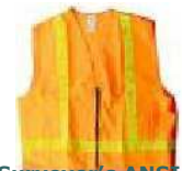
Surveyor's ANSI Class 2 Safety Vest