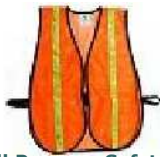
All Purpose Safety Vest with 1" Reflective Strip