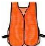
Daytime Wear Mesh Safety Vest