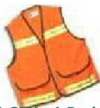
JIM-GEM® 4-Pocket Survey Vest With Reflective Strips