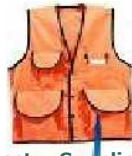
Forestry Suppliers 10-Pocket Field Vests