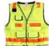
Forestry Suppliers' Class II Surveyor's Vest