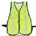
Lime Green Daytime & Nighttime Mesh Safety Vests