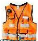
SECO Class II Surveyor's Vest