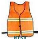
Mesh Daytime/Nighttime Safety Vest