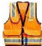
Forestry Suppliers Class 2 ANSI Compliant Mesh Vests