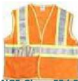
ANSI Class II/ IL DOT Class II Mesh Safety Vests