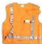
ANSI Class II Tear-Away Vests