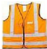
ANSI Class 2 Surveyor's Vest