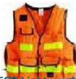
SECO Lightweight Safety Utility Vest