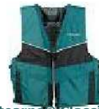
Stearns® Classic Sportvest